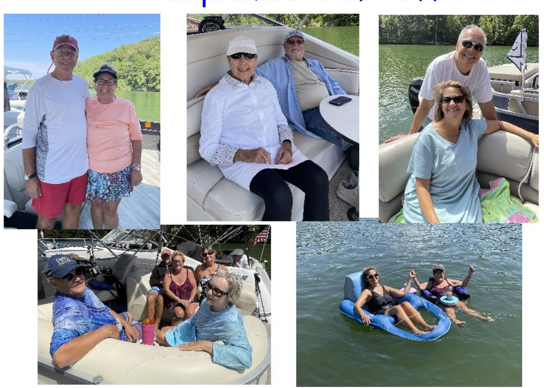
JULIET's Sip 'n Swim at Lonette's