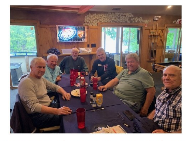
Lots more photos on our website: www.tellicocruisingclub.com