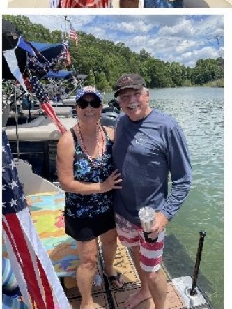
July 13 Raft Off