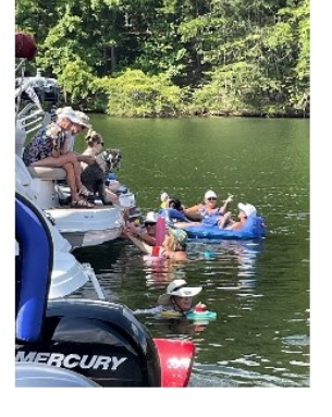
To view more photos from this year and past years go to our website: www.tellicocruisingclub.com