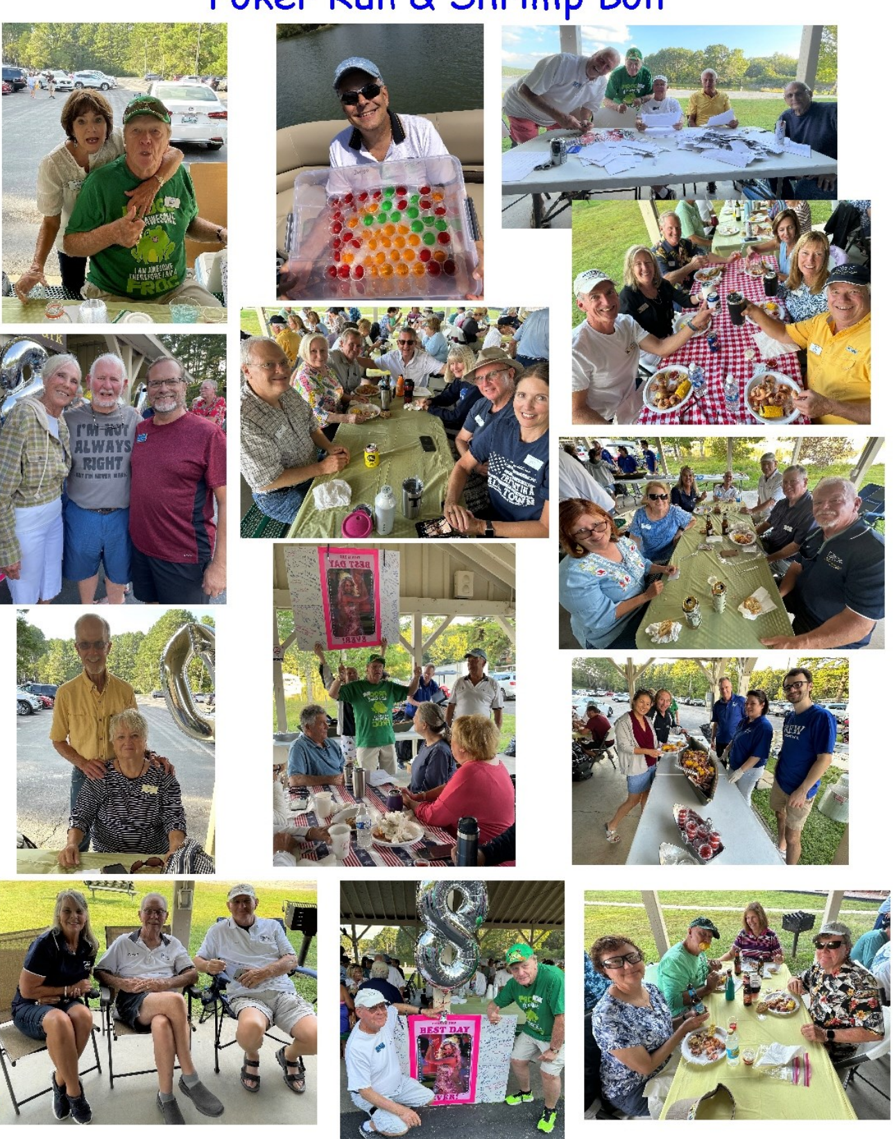
To view many more photos from these events and past years go to: www.tellicocruisingclub.com