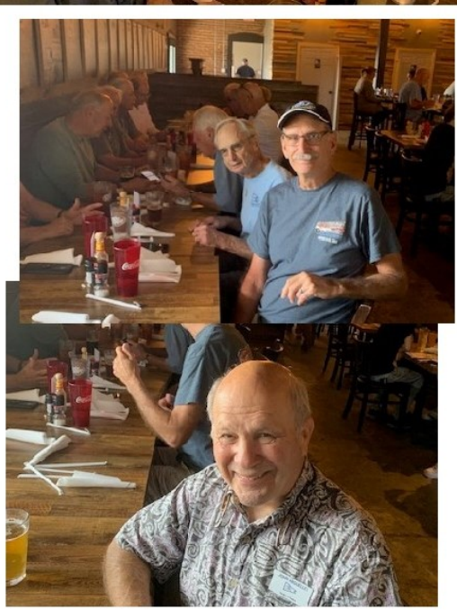
First Day of Fall Raft Off