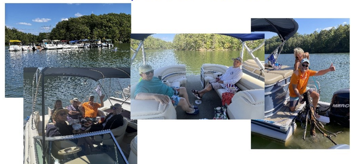
To view more photos from this year and past years go to our website: www.tellicocruisingclub.com