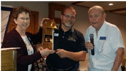
Passing of the Bell