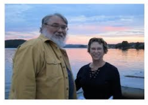
Be sure to check our website for more photos and info: www.tellicocruisingclub.com