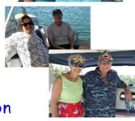
Howl at the Moon