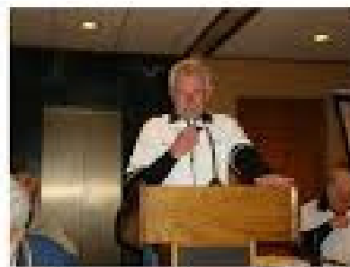
Our new Commander officiating his first meeting