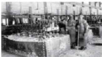
Made in Tennessee - Manufacturing Milestones October 4, 2014 - February 1, 2015

History speaks through the Museum of East Tennessee History's permanent and changing exhibits! At the heart of the museum is the award-winning signature exhibit, Voices of the Land: The People of East Tennessee , a moving, artifact-rich journey through more than 300 years of life in East Tennessee. Popular, too, is the East Tennessee Streetscape , a true step back in time, wherein visitors can peruse the Corner Drug Store or climb aboard Island Home-bound Streetcar No. 416. Several times a year, changing exhibits installed in the Rogers-Claussen Feature Gallery highlight special stories from East Tennessee's past.